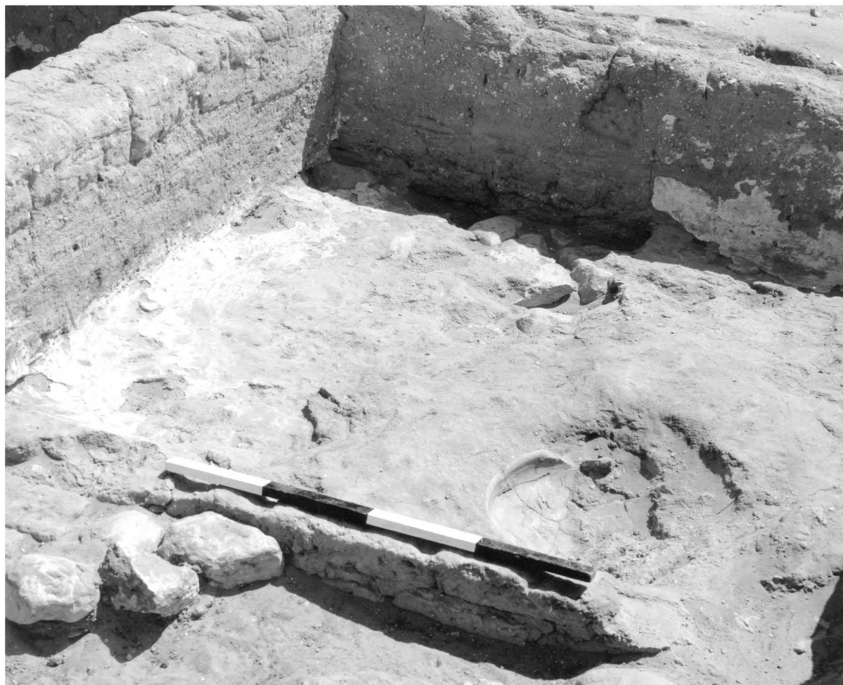
Figure 4.4. Area i, looking south-east. Note the gypsum floor and sunken pottery bowl.

soil. Some irregular additions had been made on the east, which had subsequently been covered by a low stone wall [2347] (not shown in Figure 4.2, but visible in Figure 4.5). On the west, modern disturbance has exposed the outline of an original low enclosure wall [2537]. This shows that originally twenty of these plots were laid out, in five rows of four (ignoring in the count the double-sized plot in the middle).