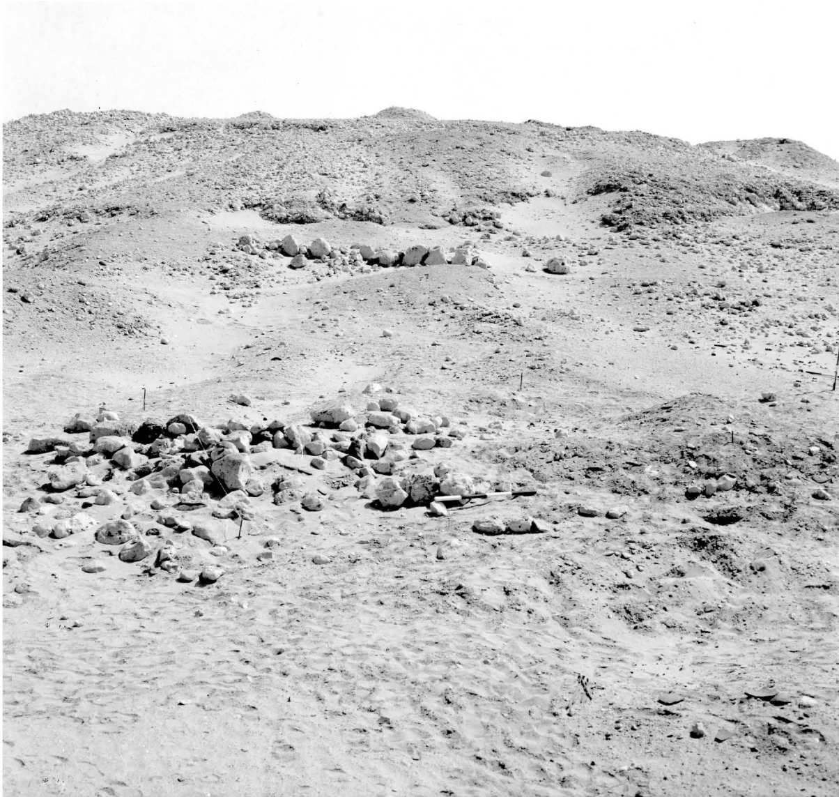
Figure 4.1. View of the site before excavation, looking east. Most of the boulders lie in square T28. On the hillside above the line of stones probably marks a court in front of a tomb entrance (no. 557).

organic cover in vi passing immediately into desert [2359], and in v into a hard surface of marl and organic matter [2735]. A similar deposit [2736] covered the additional space to the north-west enclosed by a rough stone wall [2201], Area vii. Near the northern edge of the excavation a second stone wall [2203] curves out to create a smaller, inner area, Area viii. Perhaps we have a further paired arrangement of animal pen and court.