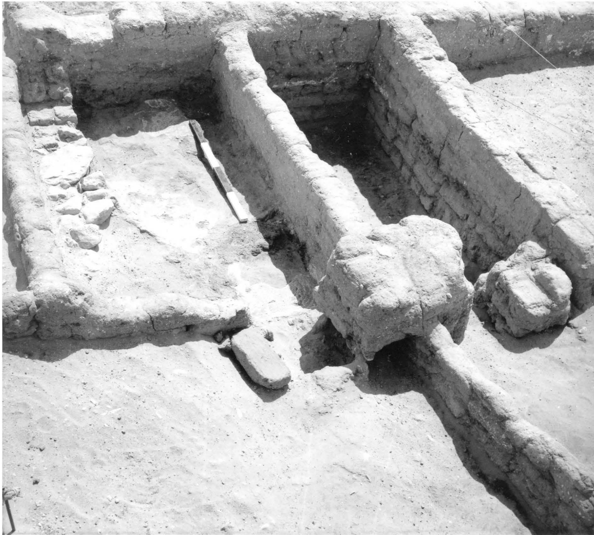
Figure 4.3. Areas ii and iii, looking south.

of abandonment the intervening wall there had been demolished to its lowest courses and was no longer visible above the organic floor cover [2087]. In connection with this the second outer doorway was blocked with rubble [2476]. Furthermore, although modern pitting has damaged the record, it looks, too, as if the wall which divided Areas iv and v was also removed, for the final organic fill [2197] seems to have run across its line. Thus at the very end of its history, Building 200 consisted simply of an L-shaped court (Areas i, iv-vi) partly surrounding the two pens, Areas ii and iii.