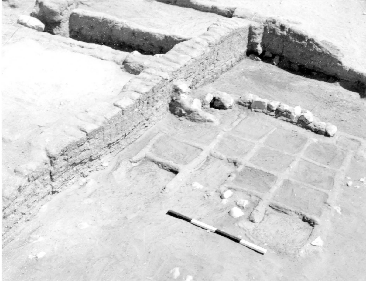
Figure 4.5. View of the garden plots at an early stage of excavation, looking east. Note the rough stone wall [2347] running along the back of the plots.

42.5 cms. Even with the degree of variation that is present in private gardens, it is evident that there was a generally accepted idea of proper plot size which hovered around a dimension slightly smaller than a cubit (one resembling the "small cubit").