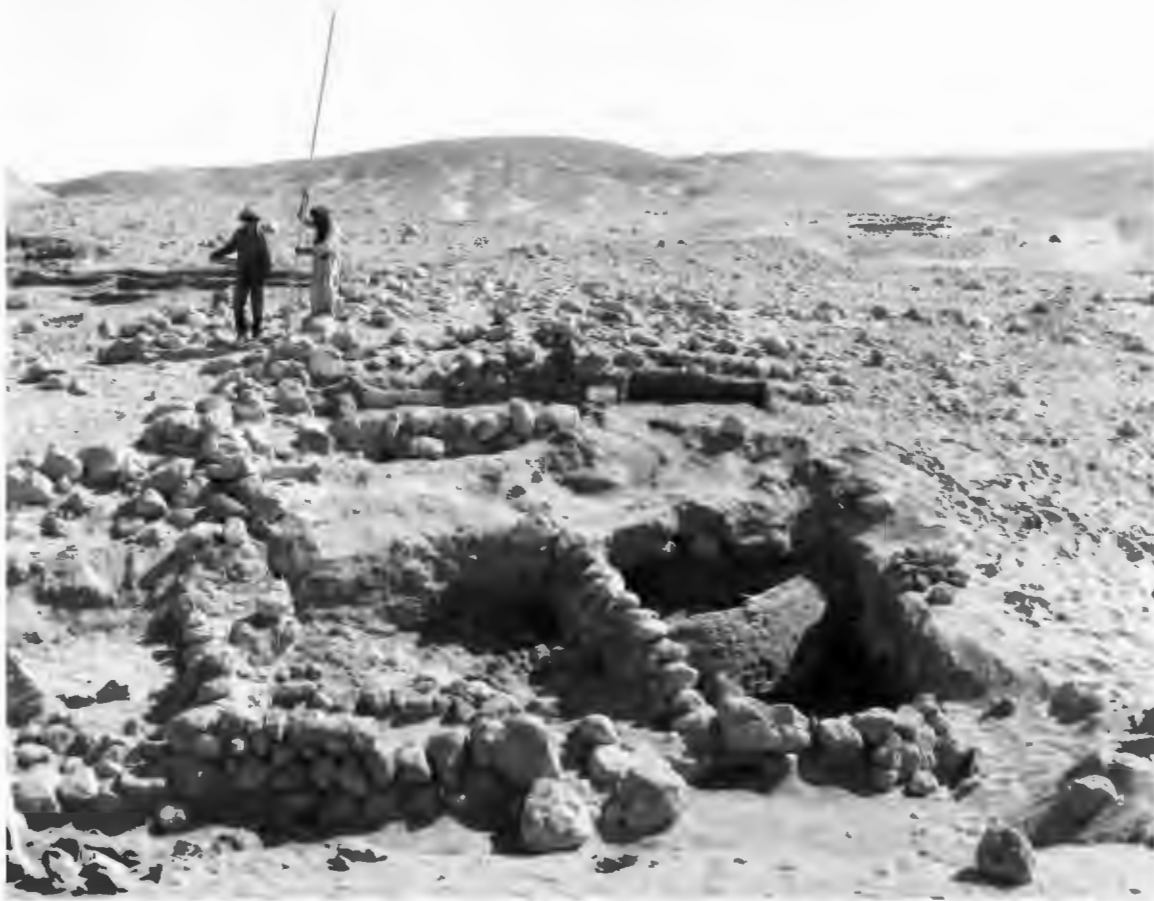
Figure 3.1. View of squares R10 and S10 at an early stage in excavation, looking east.