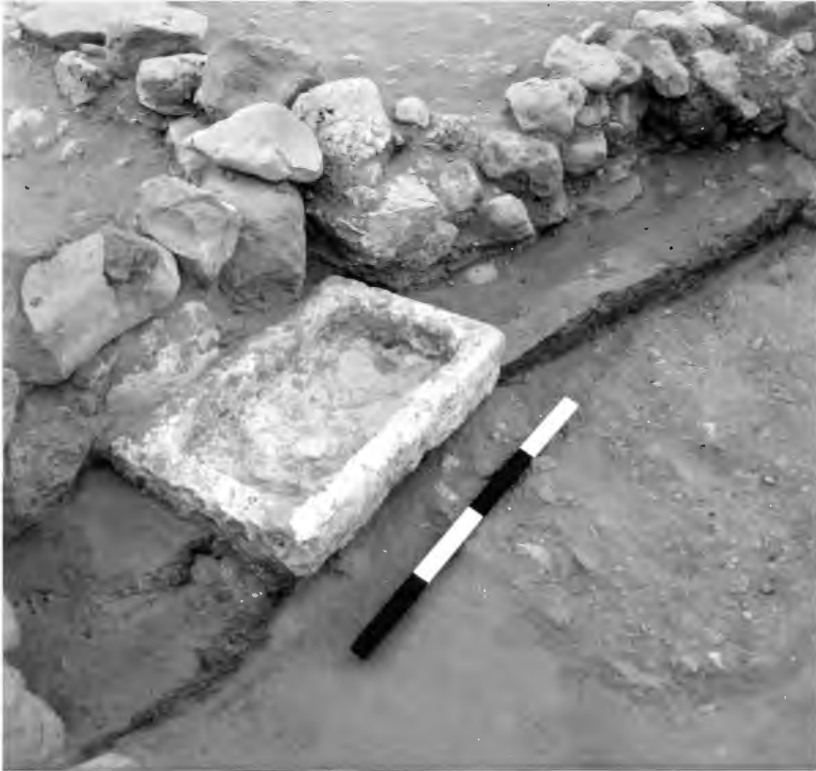
Figure 3.6. Limestone trough [1448] and sectioned organic floor deposit [1405] in Area vii , square S10, looking south-east.

[1446, 1450] had been constructed along the north side of the court, Area vii . The purpose of this, unless to create a dry food trough, is not clear.