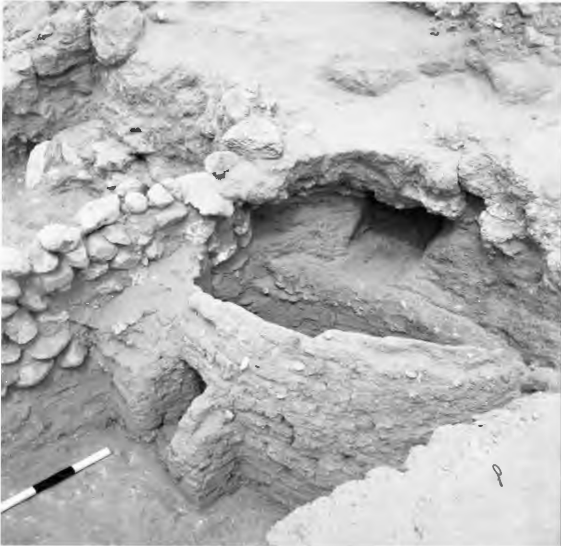
Figure 3.4. View of the courtyard and pen ( Areas iii, iv ) in squares R10 and S10, looking north-east.

eastwards, and this slope had later been accentuated by weathering. The pen thus came to have the appearance of the lower part of a dome which had been taken up to the level of the bedrock overhang (cf. Figures 3.3 and 3.4), but this may be an illusion. Insufficient bricks were found inside the pen to account for the collapse of a dome, and it is therefore likely that an oval gap was left between the top of the wall and the edge of the overhang. This would have been required, in any case, to allow for inspection of the animals and cleaning of the interior. It might be noted in passing that neither were wood nor grass from a light roof found in the fill. The surface of the rock face had been coated with mud plaster [1432] of which the lower part only survived. At a level well above the floor a small cavity [2053] exists in the rock face. The "rock" is so soft and crumbly that it was difficult in practice to clear the cavity without also enlarging it slightly and it may have had initially a less regular appearance. In view of the difficulty of access to the pen it is hard to see that the cavity would have served any useful purpose, and it is likely to be a natural product of