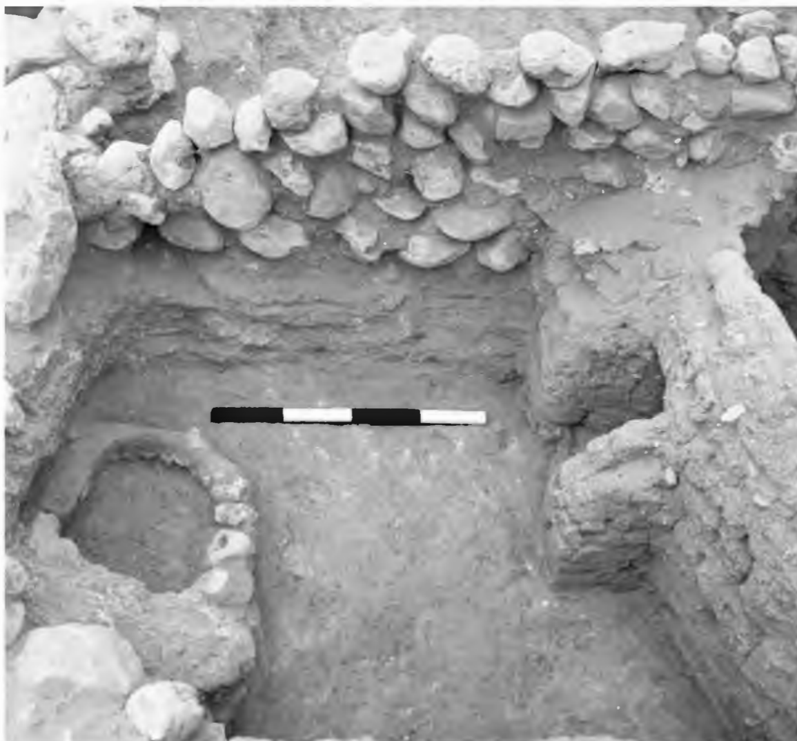
Figure 3.3. View of the courtyard and pen ( Areas iii, iv ) in square R10, looking north.

removal of the organic layer exposed a low circular construction of stones in mortar [1803]: presumably a feeding-trough, resembling the one in Building 250, Area viii , unit [1864] (see Figure 2.5). This probably lies close to the exit from the courtyard, still buried in the ground. By the time of abandonment this roughly built trough had filled completely with organic material and had probably been replaced by a rectangular limestone trough. This had been removed anciently, but the shallow depression where it had stood [1442] was noted on the surface of the organic floor layer [1407].