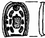
Figure 12.2. Object no. 5410, blue faience ring bezel with prenomen of Tutankhamun written in a slightly variant form (with plural strokes to left). Scale 1:1.

Recent excavations have, however, furnished one addition to the published bezel corpus (object no. 5410), a Nb-hprw-Rc design with the plural strokes in a vertical line to the left of the hpr sign. This reverses the placement of Petrie type 109 (1894: Plate XV, and cf. no. 112), and is a more complete and clearly moulded example. A trace of the nb basket remains at the bottom (Figure 12.2).