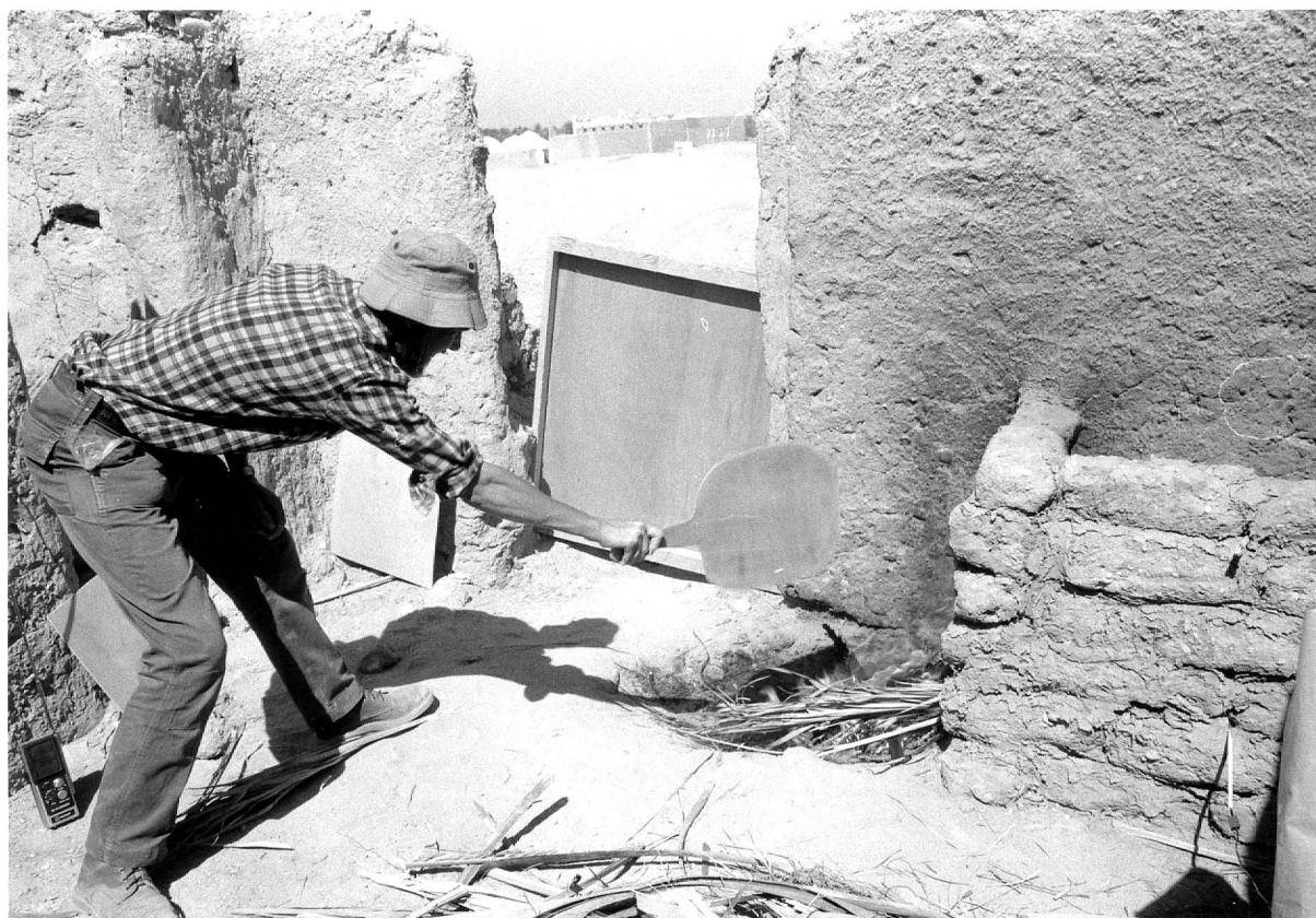
Figure 11.8. Using the wooden fan during a firing.