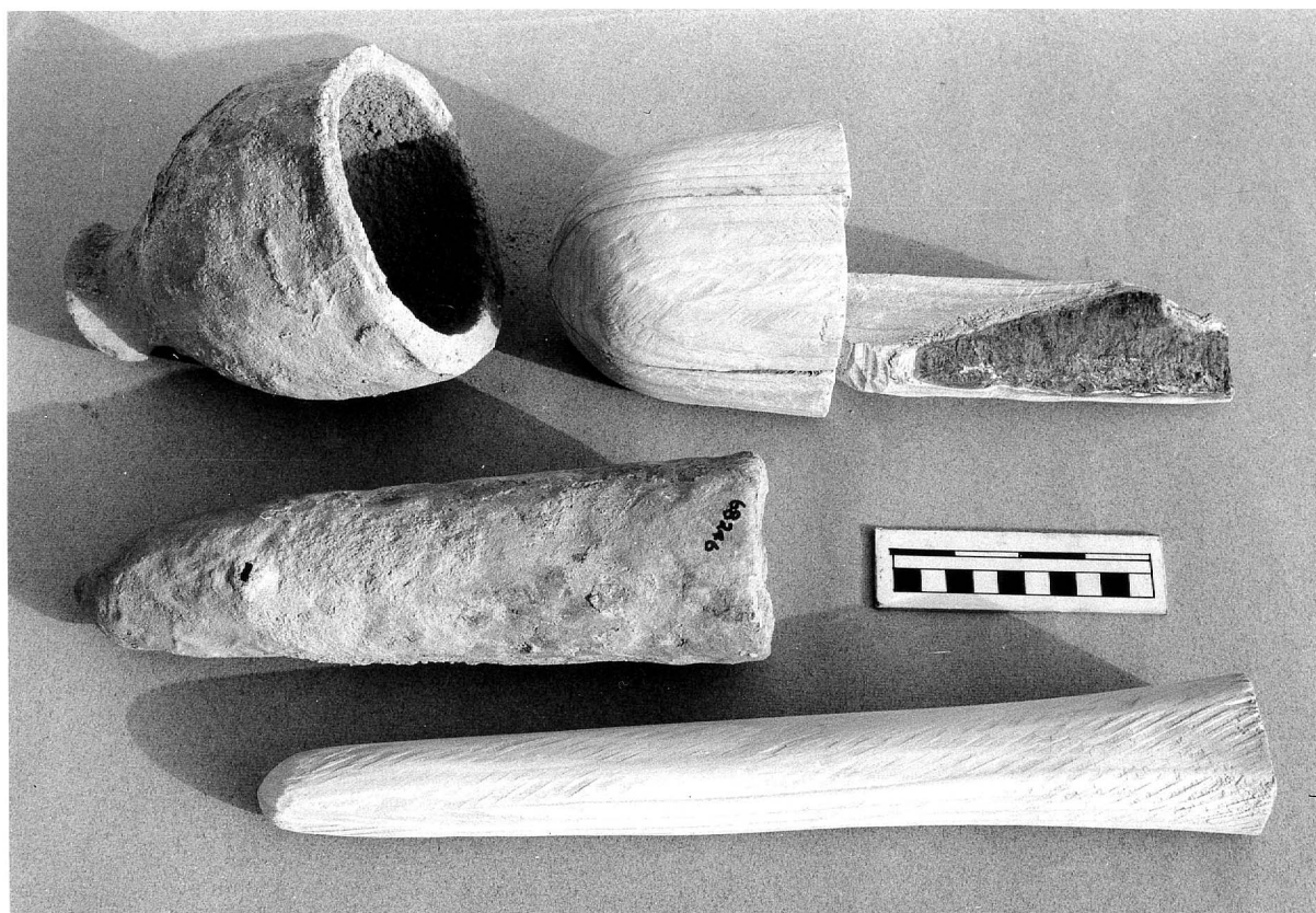
Figure 11.2. Bread moulds from Chapel 556 alongside replica wooden patrices .

process repeated again, the total preparation time for the 3 kg taking about 5–10 minutes. This form of “wedging” made the clay much more readily workable (Figure 11.3).