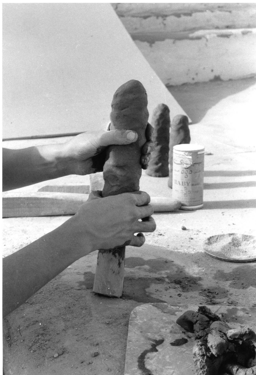
Figure 11.5. Pressing clay around a patir whilst it is rotated.

was noted that the height of the structure was the maximum at which a man of average height could easily step inside. Though the lattice covered the whole floor area of the structure, the matting covered only the rear 40 cm, while at the front some of the fibrous material from the limb of the branch was allowed to protrude into the fire pit. This was to allow the fire to spread more easily into the kiln itself. On top of this arrangement of fuel were placed the vessels themselves. Approximately thirty-five of the conical moulds were placed in three rows with about five vessels lying flat on top of them. The thirty stood with their open ends uppermost as in the excavated example. The nine hemispherical moulds were placed on their sides at the front of the kiln, openings facing the rear of the kiln. The two blocks designed to measure shrinkage were placed amongst these. Over the moulds was placed a layer of broken sherds. It is not known whether this practice had been employed originally since the upper part of the excavated structure had been destroyed, and sherds may have been removed. It is, however, a practice well known ethnographically from many countries including Egypt (Nicholson and Patterson 1985). At the