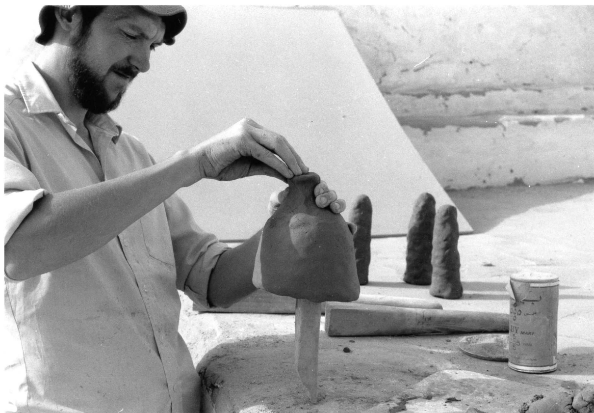
Figure 11.7. Forming the knob on a hemispherical bread mould.

firing three loud cracks were heard, and it was expected that some damage had occurred to some of the vessels.