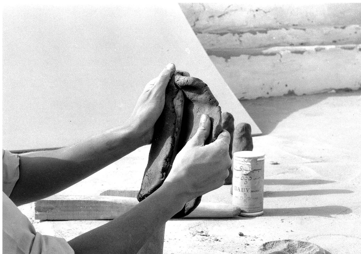
Figure 11.4. Wrapping clay around a patrix .

However, it should be noted that the moulds already showed a coating, somewhat like that of the originals, derived from the ash spread over the smooth surface of the patrix , contact with which had the effect of bringing the fine particles to the surface. It may not therefore have been necessary to use a separate slip at all.