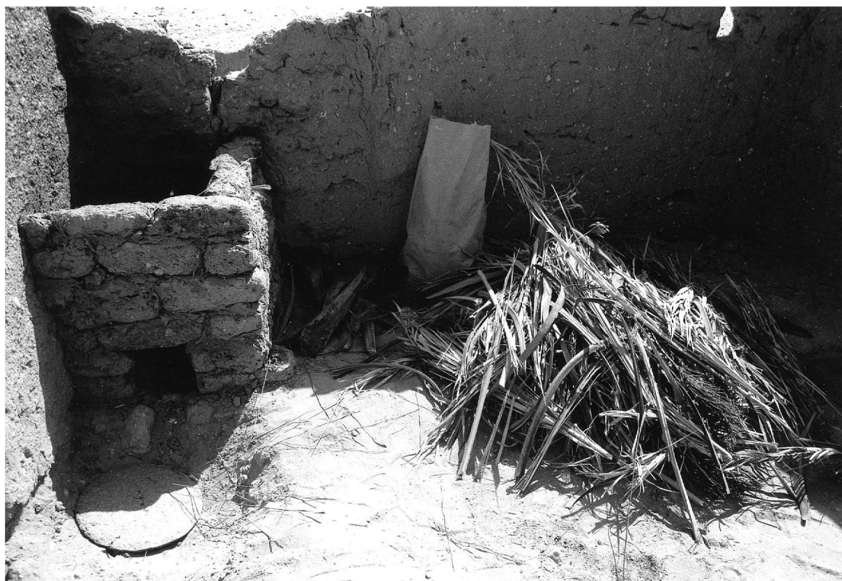
Figure 11.1. The reconstructed “box oven” and pile of gereed fuel.

The structure was built from mud bricks collected from tumble from the building mortared together with straw-tempered dung plaster. A pit corresponding in size to that at the village was also dug into the floor of the building. The whole operation took approximately half a day, after which the structure was allowed several days to dry whilst other operations were performed. The finished structure is shown as Figure 11.1. A small hole was left in the wall of the kiln for the insertion of the thermocouple, used to measure kiln temperature during the firing.